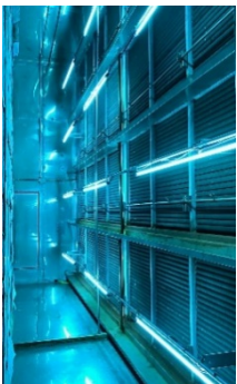
Air Handler Disinfection

For more information on Fresh-Aire UV systems or to discuss your specific application, please contact 1-800-741-1195 or email sales@FreshAirUV.com .