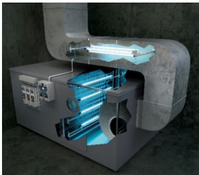
AHU / RTU & Airstream Disinfection